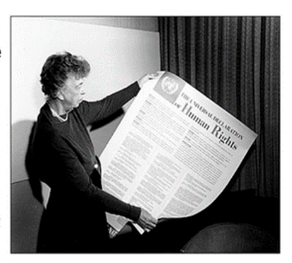
- Eleanor Roosevelt

Where do universal human rights begin? In small places, close to home - so close and so small that they cannot be seen on any maps of the world. Yet they are the world of the individual person; the neighbourhood he lives in; the school or college he attends; the factory, farm, or office where he works. Such are the places where every man, woman, and child seeks equal justice, equal opportunity, equal dignity without discrimination. Unless these rights have meaning there, they have little meaning anywhere. Without concerted citizen action to uphold them close to home, we shall look in vain for progress in the larger world"